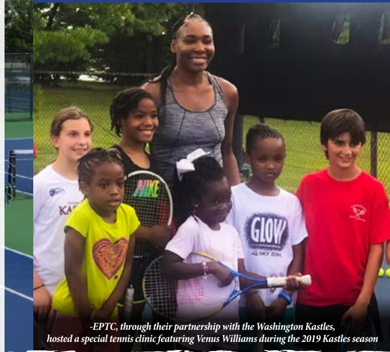
-EPTC, through their partnership with the Washington Kastles, hosted a special tennis clinic featuring Venus Williams during the 2019 Kastles season