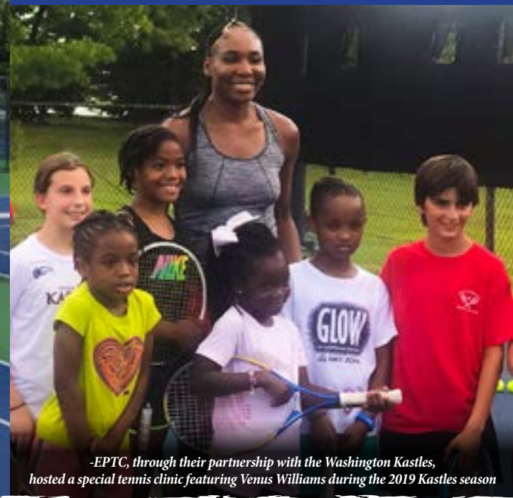
-EPTC, through their partnership with the Washington Kastles, hosted a special tennis clinic featuring Venus Williams during the 2019 Kastles season