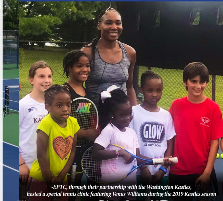
-EPTC, through their partnership with the Washington Kastles, hosted a special tennis clinic featuring Venus Williams during the 2019 Kastles season